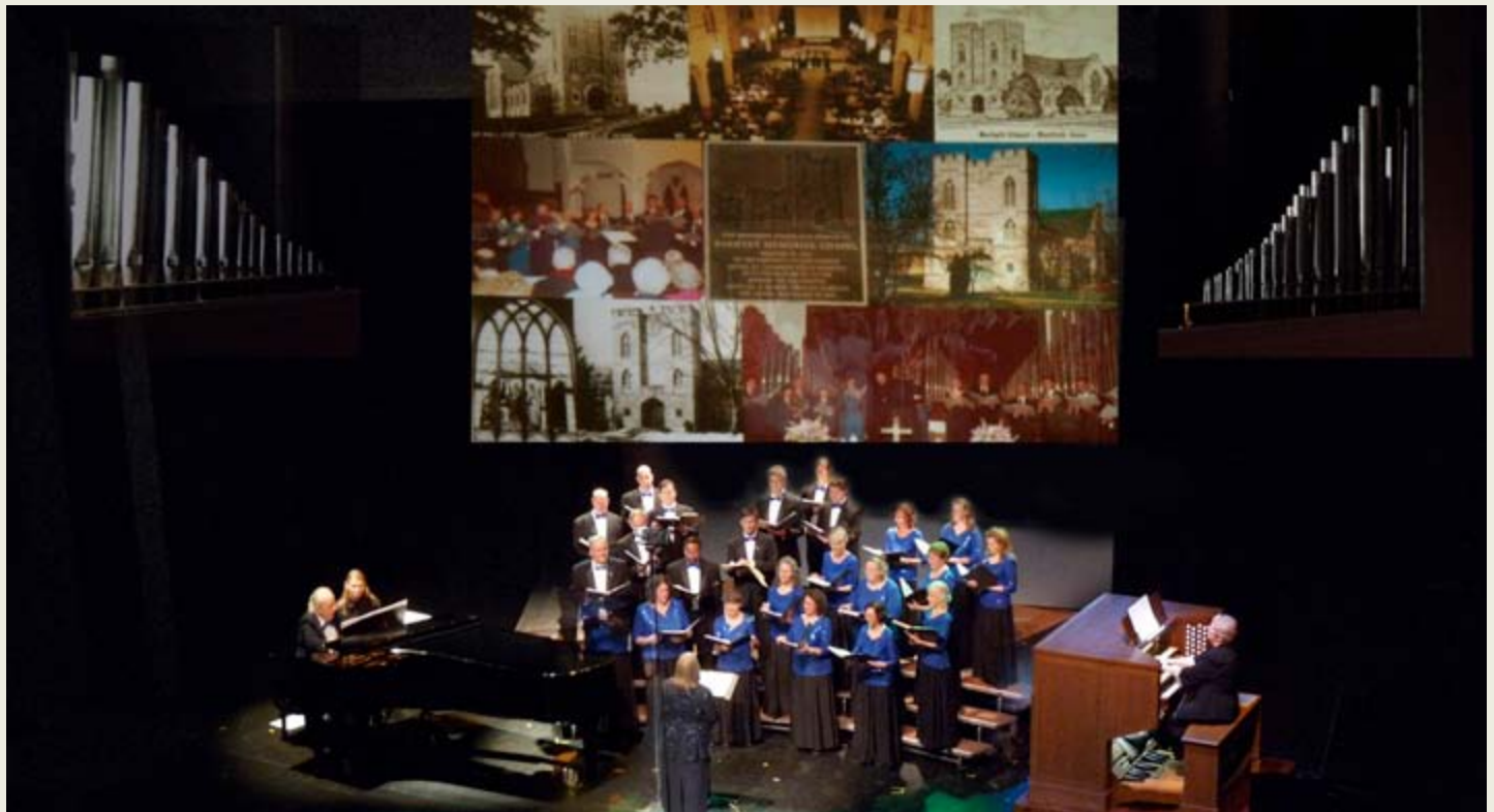
The 20th Anniversary of the Chamber Singers of Southeast Iowa was celebrated in a wonderful concert featuring the organ.